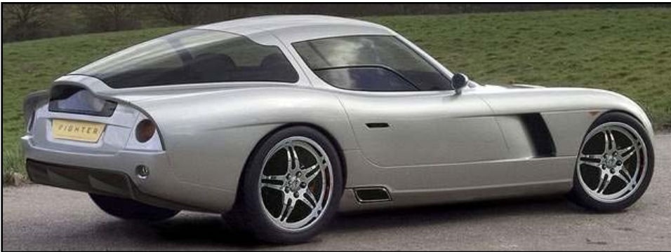
A Bristol Fighter T, a unique super car that pumps out gobs of horsepower

There is good news however, Lotus has announced 6 new models. Spyker Cars of Holland is moving production of their supercar to Coventry. The more significant news comes from MG. They have been building small batches of the mid engine MG TF for the last three years. That production will increase and a new four door hatchback, the MG 6 will be released shortly.