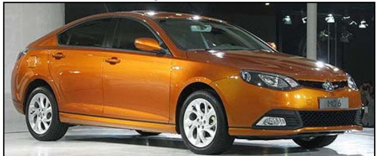
This new MG 6, a four-door hatchback will soon hit the roads

Who are the largest automobile manufacturers in England? Toyota, Honda and Nissan. The largest British based marque? It might just be the London Taxi Company of Coventry! Yes, they really do build in England and have done so for 60 years. Other contenders include Morgan (of course), McLaren, Noble, Caterham, Westfield, Ariel, Ginetta and Ascari. Fans of Top Gear will recognize the names. Bentley, Rolls, Jaguar, Land Rover and Mini, all foreign owned. Aston Martin ownership is multi-national. Don't count AC Cars as they are now being made in Germany. What about TVR? There is a report that an un-named entity is hoping to resurrect the company.