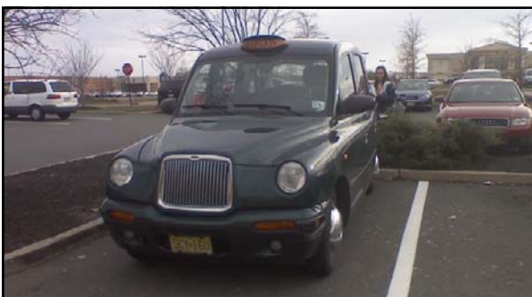
A London Taxi built in Coventry, but where was this picture taken? Clue: look at the license plate