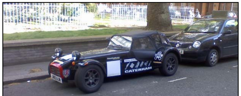
A Caterham sports car parked on the streets of London, England