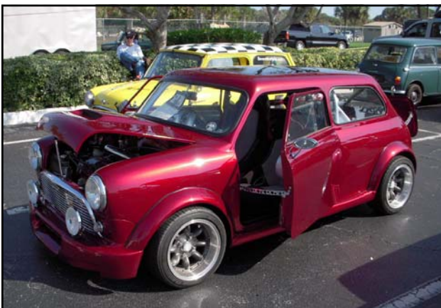
A radically customized Mini with suicide doors!

open beachfront pavilion for a catered lunch. Afterward, everyone went back to the resort to relax. Around 3:30 we lined up again to go to a local cruise that was held in a parking lot of a shopping center about seven or eight miles away. You haven't lived until you have seen the expressions on faces of people when 80 classic minis pull into a show together.... and we squeezed into 40 parking spaces!!!! GREAT FUN!!