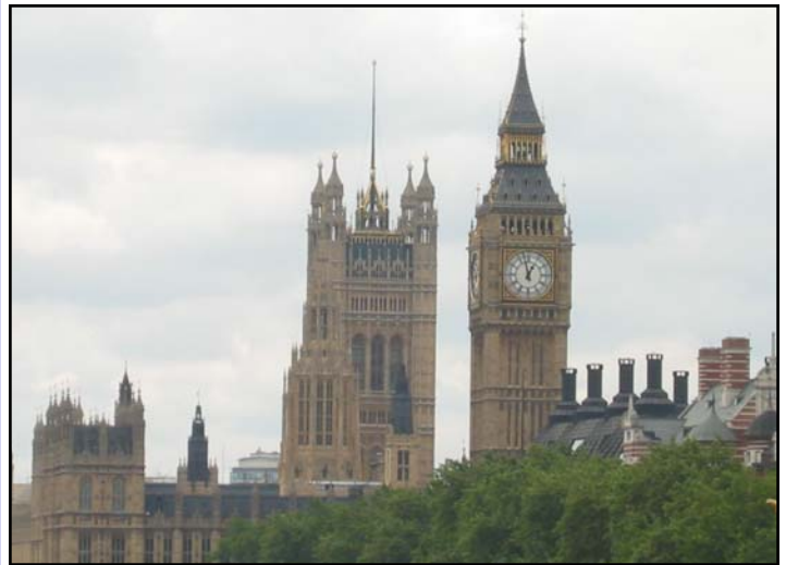
What time is it? It's springtime! Or time to revive your hibernating British cars and hit the open road. Get out there, show off your cars & promote British motoring.