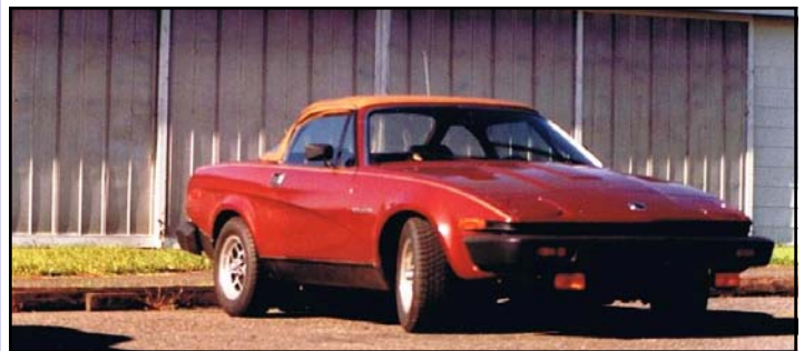
A certain 1981 fuel injected Bordeaux red Triumph TR7 that desperately needs to get back on the road.