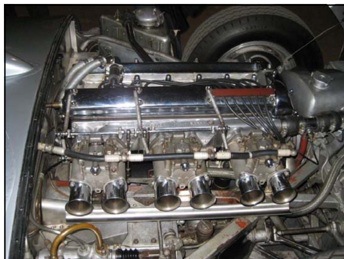
Three two-barrel Webers decorate D-type engine.

Le Mans in 1954 behind a Ferrari 375 Plus, but would probably have won had it not suffered from fuel contamination early in the race. In 1955 the D-types had no such problems and took first and third overall, following that up in 1956 with first, fourth, and sixth place finishes. Finally, in 1957, after the factory had quit racing to concentrate on developing new production models, private entrants swept the top four places at Le Mans along with sixth place overall. The car in the Simeone Museum's collection finished third overall in the 1956 Sebring race.