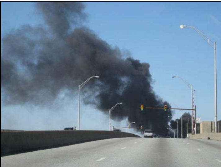
Heading over the Schuylkill River towards the scary black smoke.

We set out from our rendezvous point at Routes 70 and 539 shortly after 9AM and managed to avoid the bulk of Route 70 by taking (mostly) charming back roads north of the highway through places like Browns Mills and Vincentown. We rejoined 70 just east of I-295 and then took 295 south to I-76 and crossed the Walt Whitman Bridge into south Philly. The trip was uneventful until we noticed great billows of black smoke rising from somewhere in the vicinity of our destination. After we exited the highway for the surface streets, we were passed by a fire engine racing to the apparent conflagration. For a few tense moments we feared that the authorities might close the bridge over the Schuylkill River and we would not be able to reach the museum. Fortunately that didn't happen and we reached the Simeone without difficulty, where the museum staff graciously allowed us to park as a group in a corner of their lot.