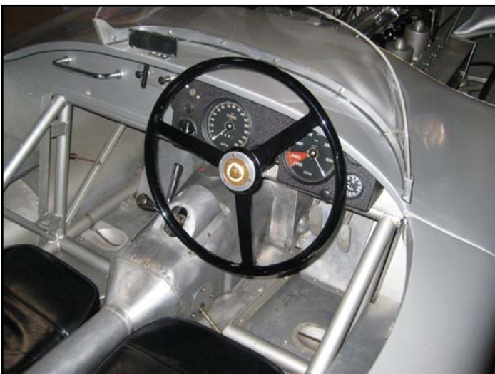
C-type cockpit showing tubular framework supporting the aluminum body.

First up was the C-type Jaguar, driven by museum curator and chief mechanic Kevin Kelly. Jaguar developed this car in about eight months, inspired by the performance of production XK-120s in the 1950 Le Mans race. To promote their street cars, Jaguar deliberately styled the front of the C-type to resemble the XK-120, but in fact the two cars have little in common aside from the magnificent 3.4-liter XK engine, which in the C-type produces about 205 horsepower versus the stock machine's 160, mainly due to an improved cylinder head and bigger carburetors. The C-type has a steel chassis and tubular framework supporting aluminum bodywork with one-piece bonnet and front wings. Most C-types had SU carbs and drum brakes all around, with torsion bar suspension front and rear and rack and pinion steering. A C-type won the 1951 Le Mans outright, but the cars failed miserably in the 1952 race when revised, "streamlined" bodywork resulted in engine overheating. A shift back to original-style bodywork led to a second Le Mans victory in 1953. The Simeone Museum's C-type came in third overall in the