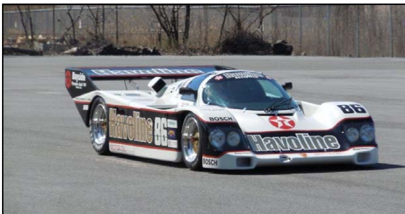
Porsche 962 in motion.