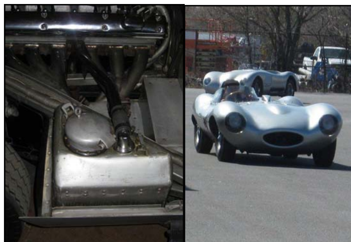
Left: Oil reservoir for D-type's dry sump lube system.