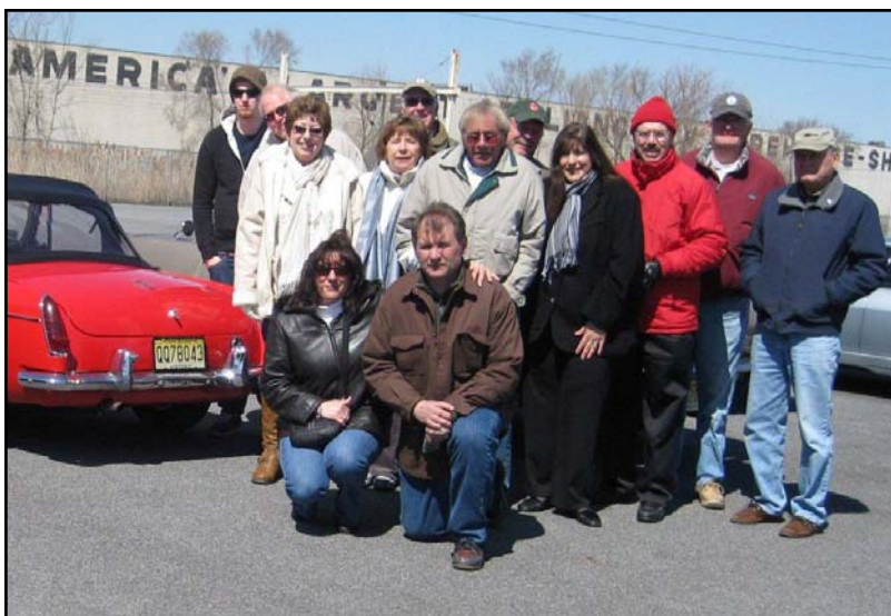
PEDCers pose for perfect picture.