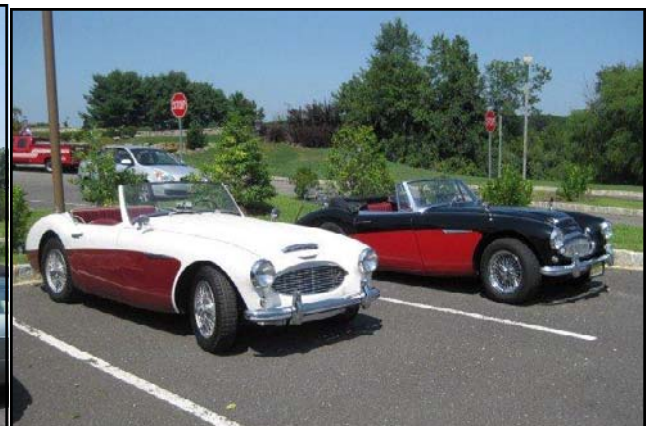
The line up of participating PEDC vehicles at Laurita Winery. Note the variety of British cars... yet the gold one in the background of the picture on the left doesn't look particularly British.