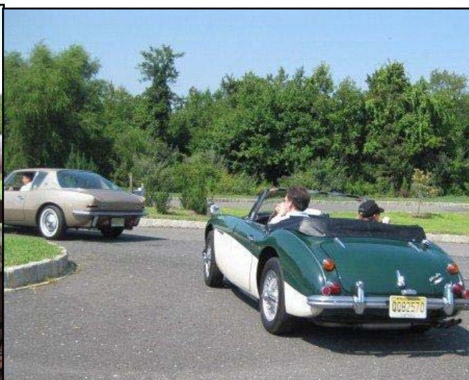
Participating cars beginning their journey home after a fun filled afternoon. Hey that gold car in front doesn't look particularly British!