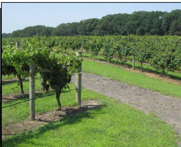
Here's just a portion of the picturesque 40-acre Laurita Vineyard. The approximately 35,000 vines here produce 140,000 bottles of wine every year.