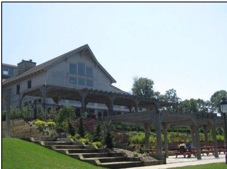
The main building at Laurita Vineyards in West New Egypt was constructed of salvaged materials from two 150-year old barns. It is also solar powered.