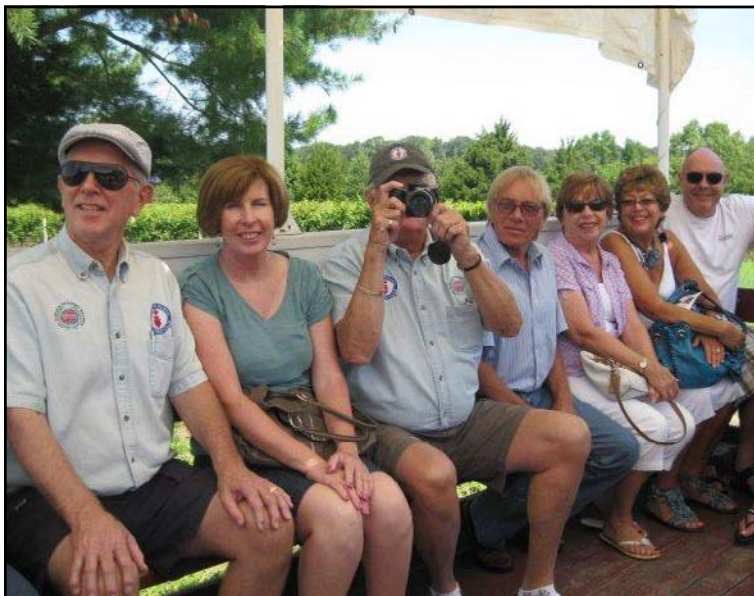
PEDC members enjoying a wagon tour of the vineyards.

http://www.vitessesteve.co.uk/ServiceManuals.htm