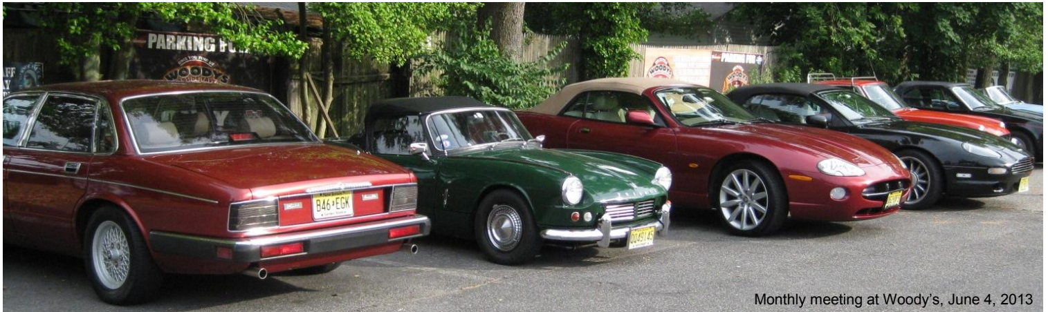
Monthly meeting at Woody's, June 4, 2013