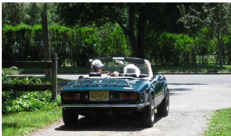
Heading home after our PEDC 2014 Father's Day show.

Get out there and drive 'em. See you at Woody's on September 3 rd . ■