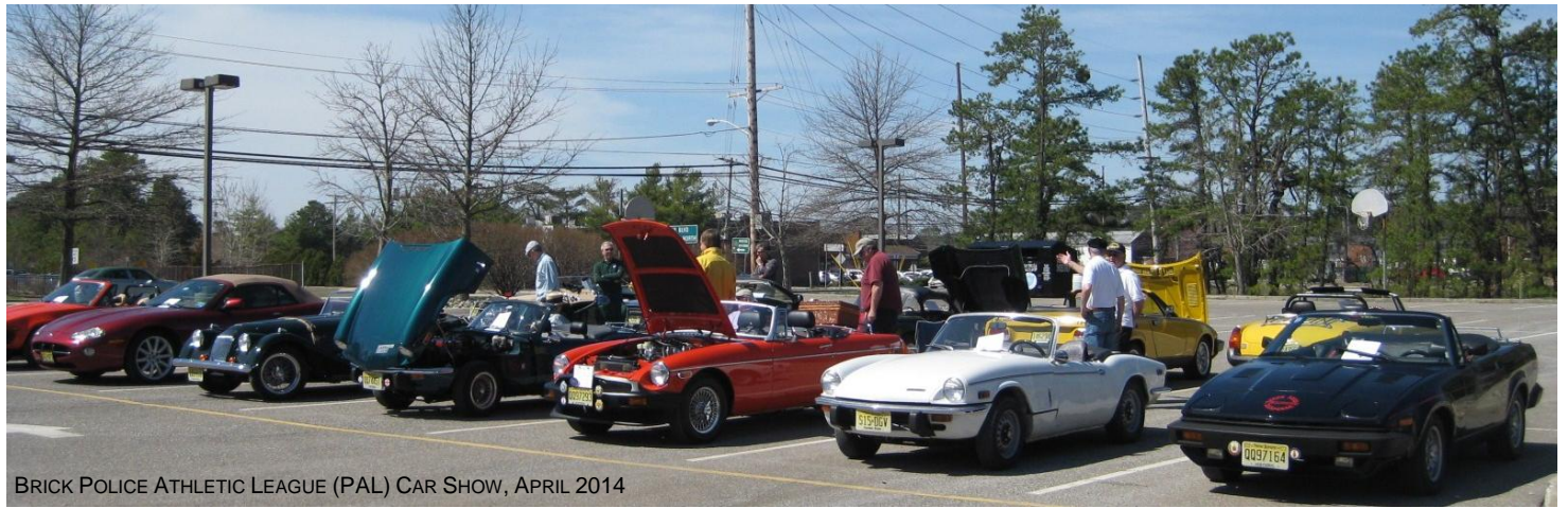
BRICK POLICE ATHLETIC LEAGUE (PAL) CAR SHOW, APRIL 2014