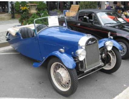
TOM BLACKWELL 1948 Morgan F4 3-Wheeler