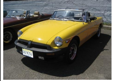
JOE GRILLO 1977 RHD MGB-LE