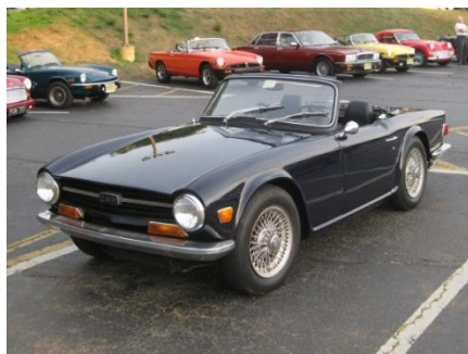
KEN WIGNALL 1969 Triumph TR6