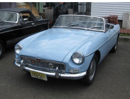
EVAN BROADBELT 1965 MGB