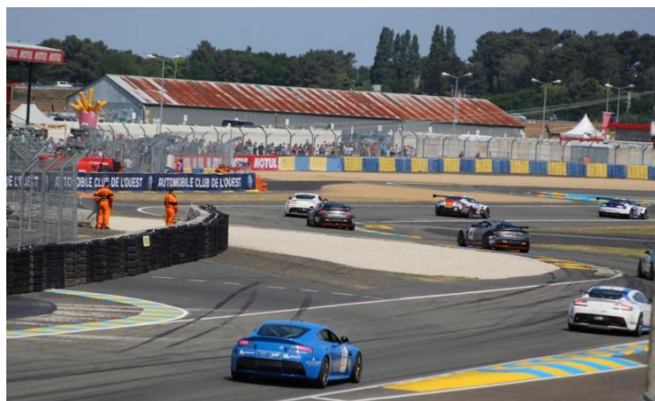
Top photo: Aston Martin cars being stripped and prepared for the race the following day. Above photo: Support race action at the Ford Chicane.