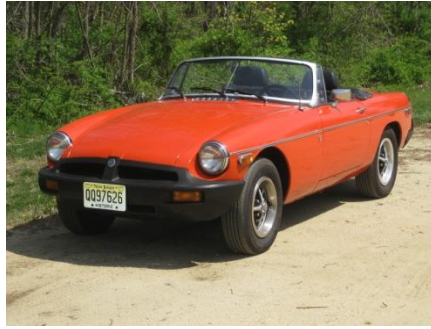
PETE LINSZKY 1979 MGB