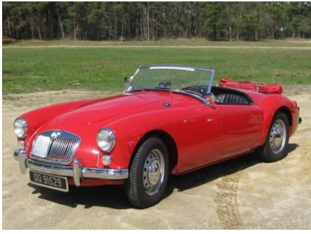
RUSS SHARPLES 1960 MGA 1600