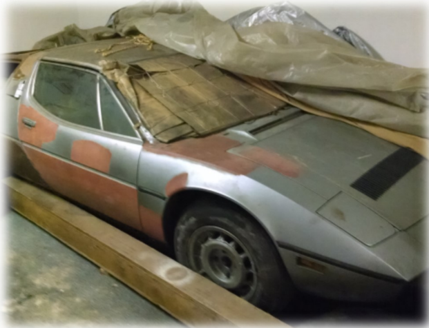
1975 Maserati Bora with 6000 miles. Hit hard in rear, stored 40+ years, sold with 1 phone call

Bill finds many different makes and models in many different conditions.