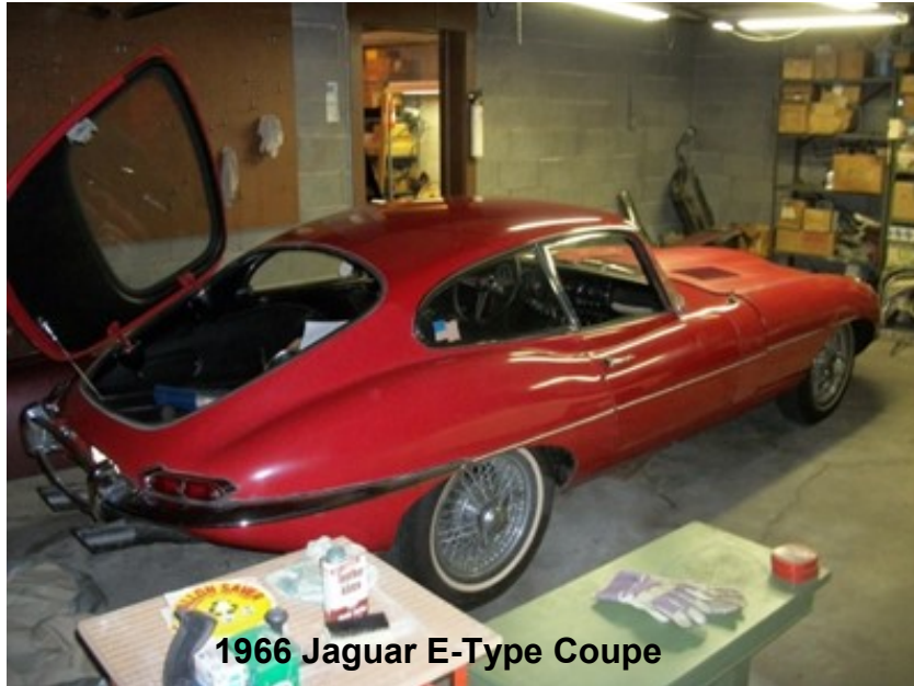
1966 Jaguar E-Type Coupe

I might mention here that my compensation was only to be paid when my employer was able to buy a car that my efforts led to. Since I was to do this work by phone and email from my home and part time I figured I had nothing to lose. My employer would email me with between 50 and 100 names, phone numbers and addresses per week of what he thought were our target owners, and I would make the calls and email him with notes on each call. If you have ever done