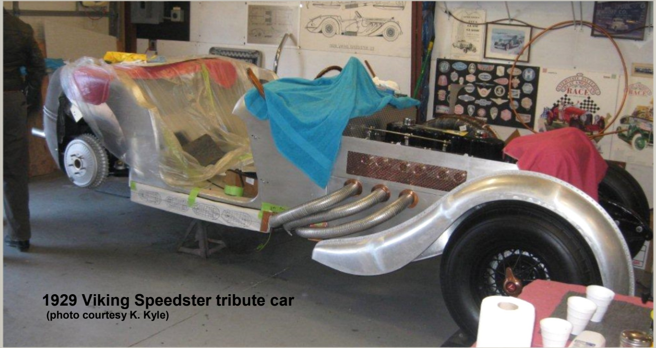
1929 Viking Speedster tribute car