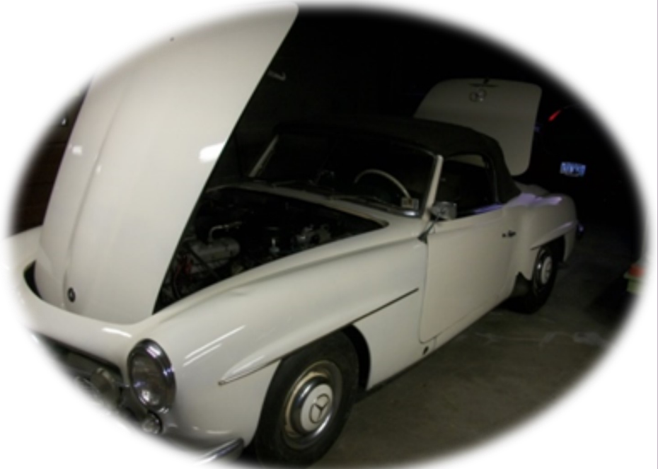
1957 Mercedes Benz 190SL