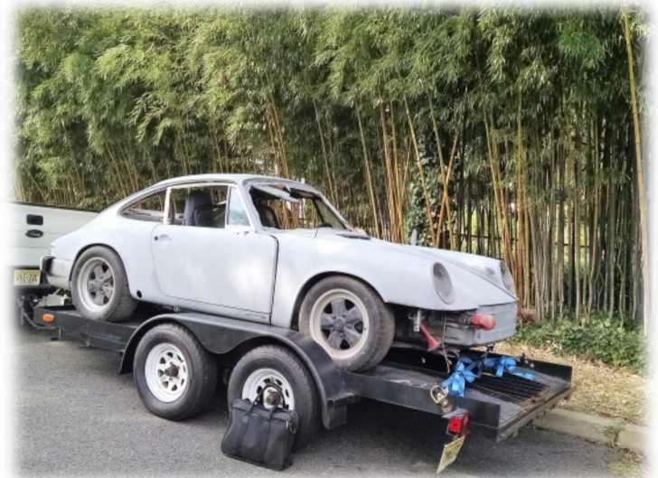
1975 Porsche 911 Project, bought in pieces, sold with 1 phone call

Bill finds many different makes and models in many different conditions.