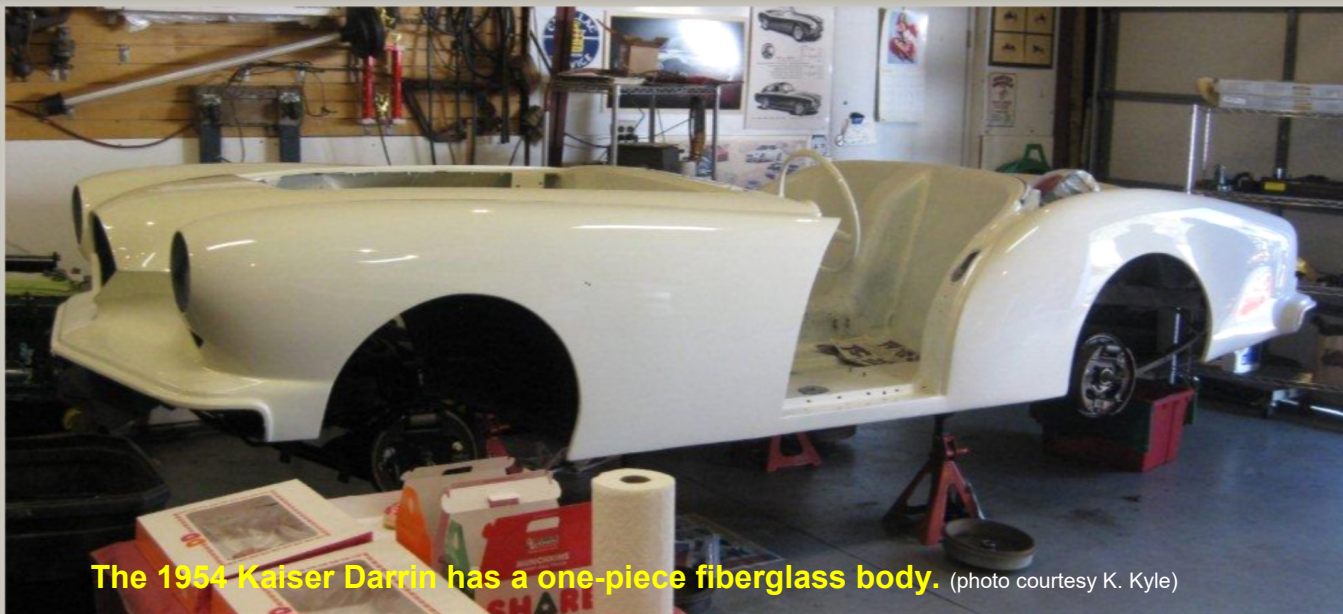
The 1954 Kaiser Darrin has a one-piece fiberglass body.