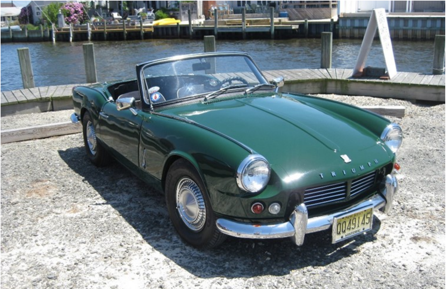
Photo of Bob's 1966 Spitfire, which was enlarged to a 12" x 18" photo canvas.