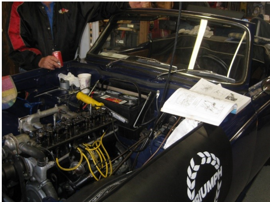
You know things are getting serious when the manual comes out.