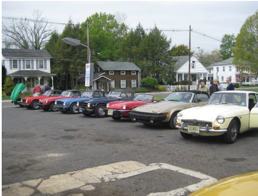
Triumphs predominated at the April 2016 Goodfellas tech session.

In 2017 we hope to do more sessions at Goodfellas and we'd love to help members with serious issues get their cars back on the road. So if you'd like to hold a tech session on your LBC, please let me know. Remember, working on your car is always better with friends on hand.