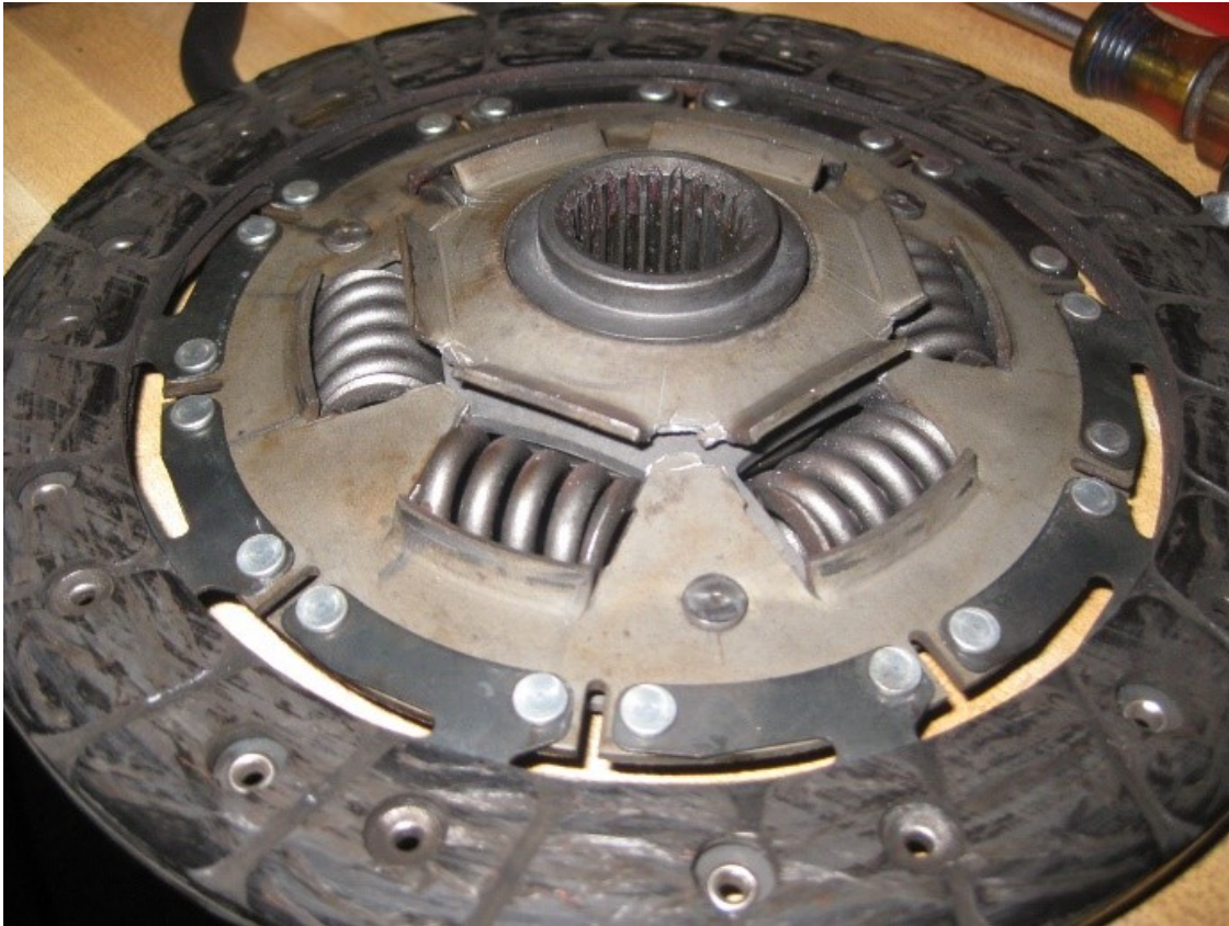
Trashed MGB clutch disc bears witness to some major abuse.