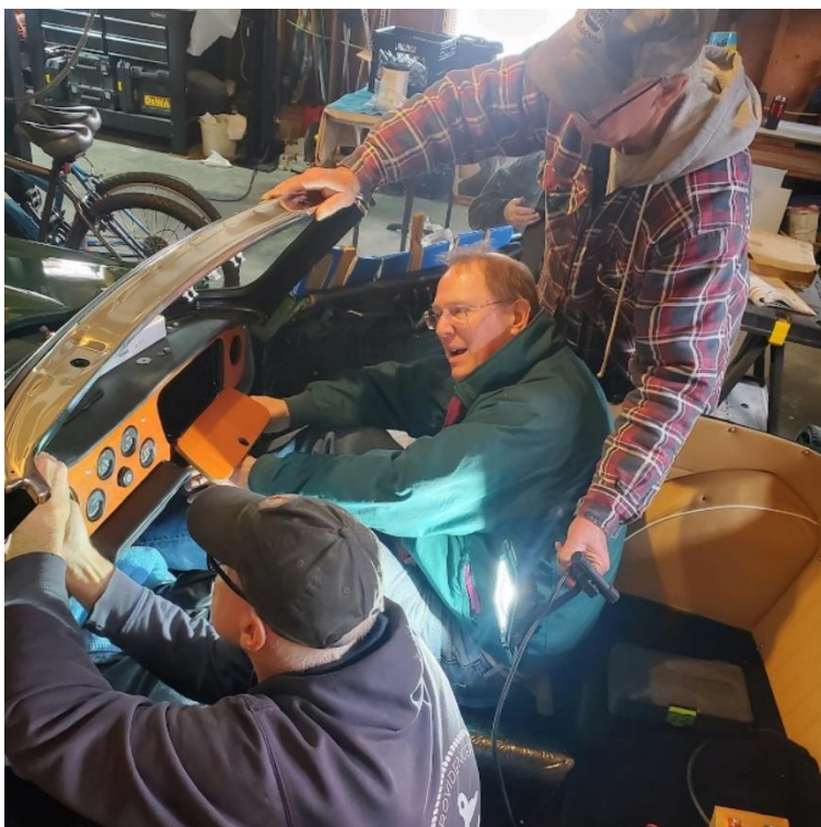
Team work as the interior comes together nicely.